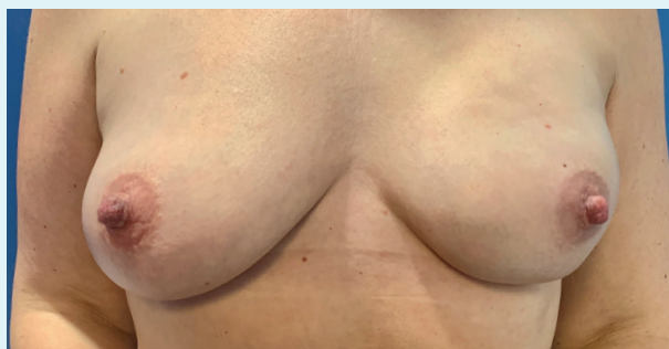
Figure 3: This woman has had a left nipple sparing mastectomy and a pre-pectoral, direct to implant reconstruction.

(or 'expansion') procedure is done in the clinic or private rooms as an outpatient procedure.