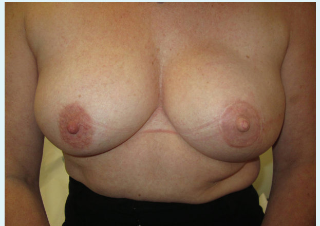
Figure 5: This woman has had a left skin sparing mastectomy and had a "free flap" reconstruction. She had a second operation to reconstruct the nipple areola complex + tattooing.