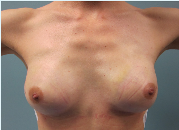
Figure 4: Bilateral nipple sparing mastectomy and direct-to-implant (single stage) reconstruction.